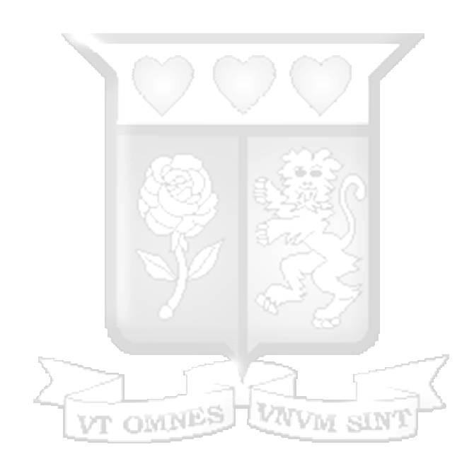
THANK YOU FOR YOUR TIME