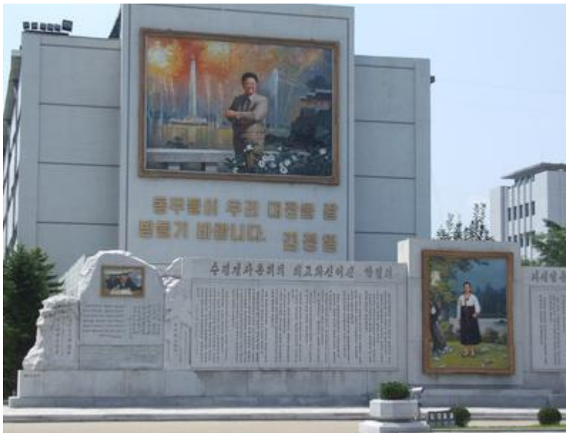
Figure 2 monument of North Korea's President.

A good case study of an unchecked government is North Korea. This is because they have a dictatorship system whereby the leader does whatever he pleases. In present day North Korea, the dictatorship is supported by government sponsored propaganda.