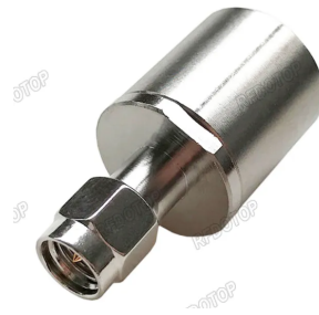
Figure 1: A ‘dummy load’ is a termination for a HF transmission line, normally connected between the inner conductor and the shielding of this transmission line