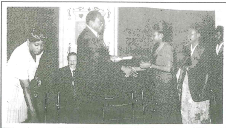
1996 Graduation and Prize Giving Ceremony