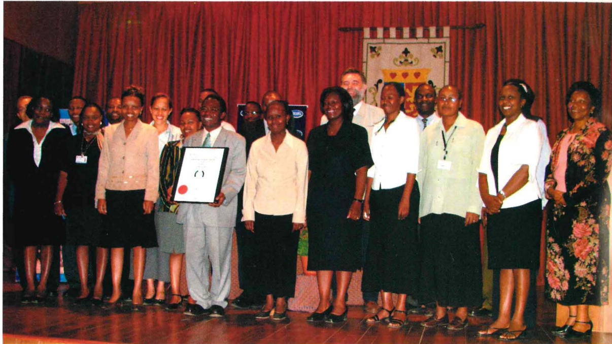
The Vice Chancellor (holding certificate) together with the people who made it all happen: the University's Quality Management Representatives

We laud every effort that helps us fulfill the vision of our university - to be the leading entrepreneurial university in the region!"