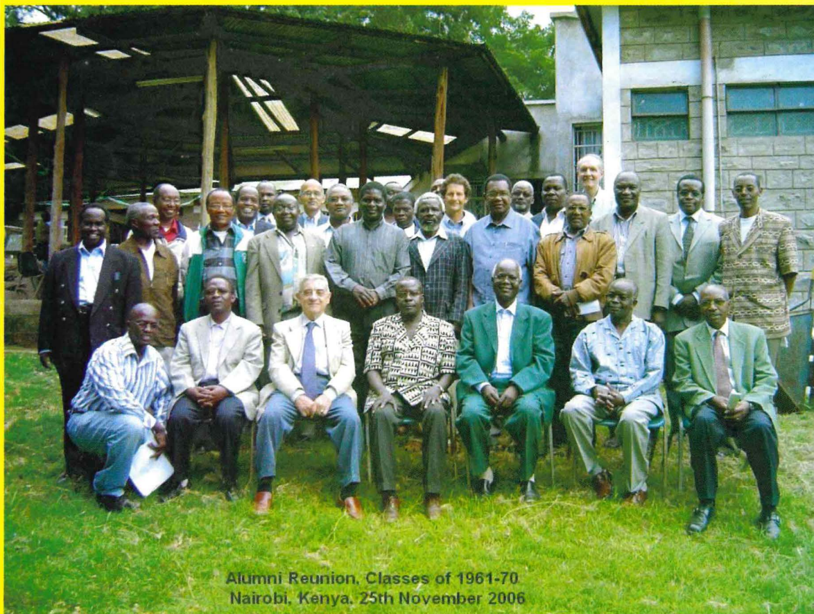
Alumni Reunion, Classes of 1961-70 Nairobi, Kenya, 25th November 2006

In the afternoon of Saturday, 25th November 2006, a reunion by alumni who had studied at Strathmore College during the pioneering years of 1961-70 was held. A total of 40 persons gathered at the Chiromo Club.