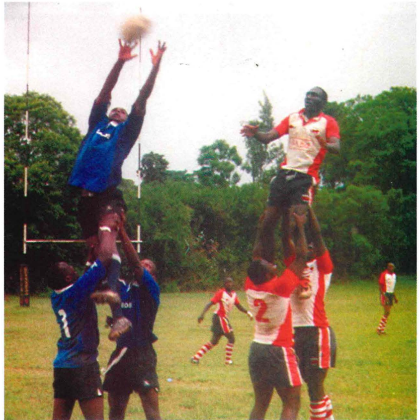
SU Rugby team (in blue) win a line out in Impala championship

The women's team, on the other hand, finished runners up in the same category. This was their first major tournament.