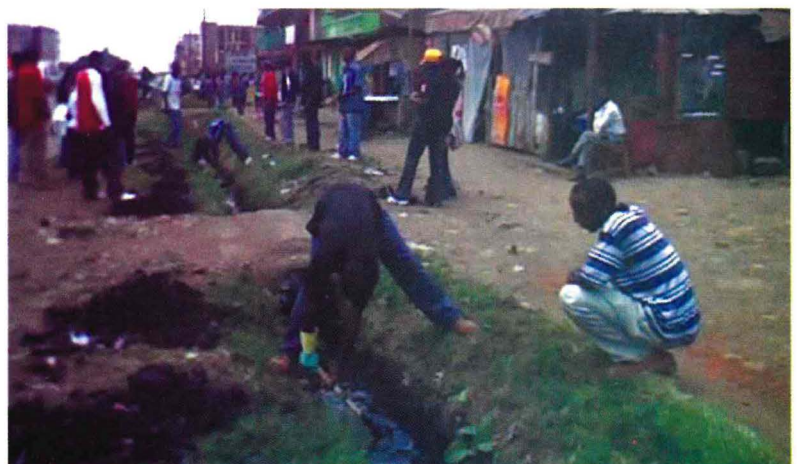
Students of Strathmore during a clean up exercise in Dandora

A total number of 119 Strathmore University students participated in the community week organised by SU-SIFE and SU SMS clubs.