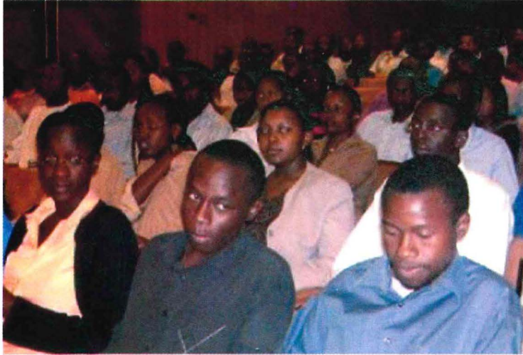
Students following the presentations during the careers' fair.

The Placement Office organised the University's 3rd Annual Career Fair on 16th February 2007 at the university grounds.