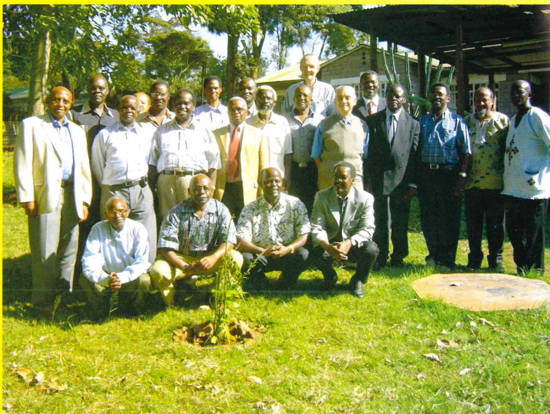
A group photo of alumni of Strathmore College, A-Level classes of 1961 - 1976 after their reunion.

5 student volunteers were on hand to help the guests with directions to the venue and registration not forgetting capturing the proceedings on camera.