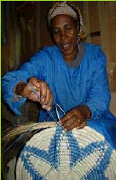
A craftswoman in Kenya...