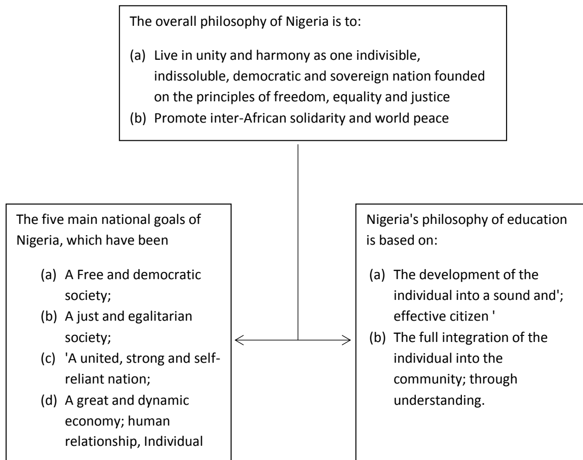
Fig 1. Philosophy of Nigerian Education

Debate abounds on whether the aforementioned ideals truly constitute the philosophy of the policy or could they at best be defined as the foundation of a philosophy that is non-