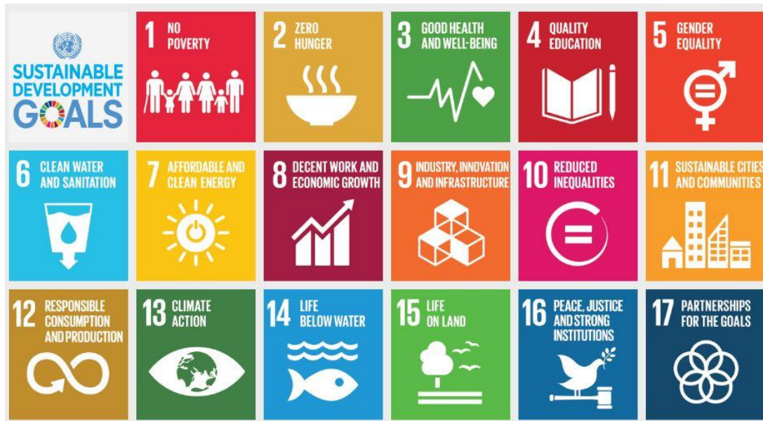
Fig 3. Sustainable Development Goals poster